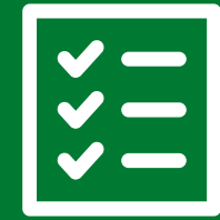
Financial and crowdfunding tools