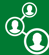
Business and networking opportunities