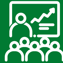
Incubation and acceleration