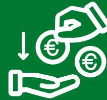
Grants and innovative vouchers