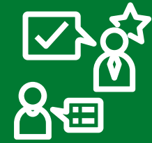
Impact measurement and reporting