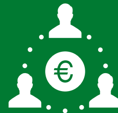
Green start-up meet investors